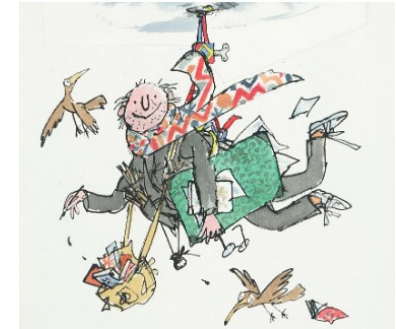
Quentin Blake illustration.