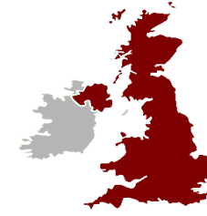
Map of Great Britain.