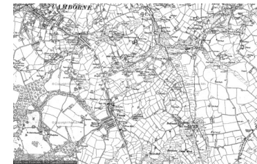
Ordnance Survey (OS) map of Troon.